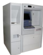
Combination with TCR