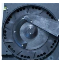
Low noise coin disk with cleaning-holes