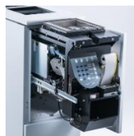
Easy to access