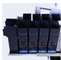
Dispensing hoppers with big capacity