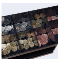
Cash tray for dispensing