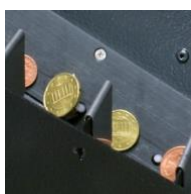
Jam-free sorting system